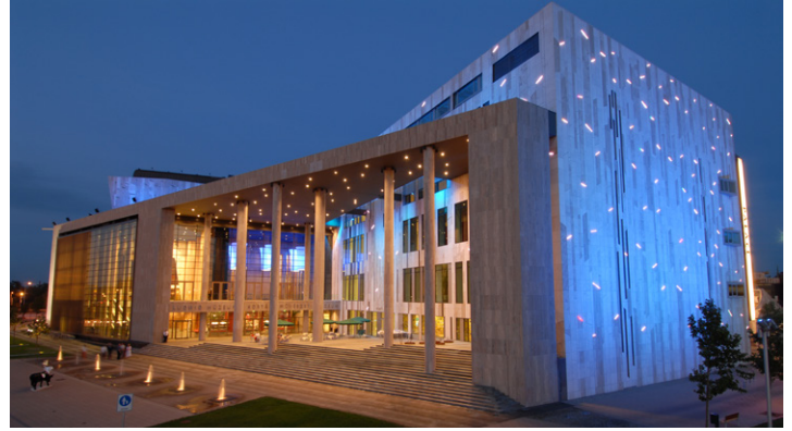
Palace of Arts, Budapest