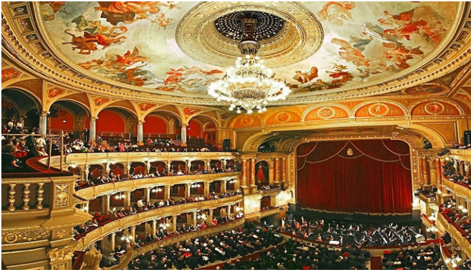
Vienna State Opera House